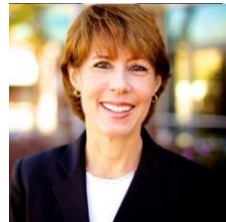
Vice Chair State Attorney's Office 2 nd Judicial Circuit