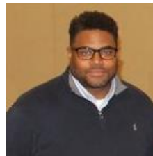
Past Chair Florida A&M University

Gwen Graham is an activist for women's issues, public education, the environment, and ethics in government. Gwen served as the Congressional representative from Florida's 2 nd District during the 114 th Congress and was a Democratic candidate for Governor of Florida in 2018. She is an attorney and prior to her service in Congress, practiced law in Washington, D.C., and Tallahassee, Florida. In Tallahassee, she focused her practice on supporting public education as the lawyer for the Leon County School District. Gwen has worked on several presidential campaigns, and in 2004 served as Secretary John Kerry's surrogate coordinator in Florida. In addition to the City of Tallahassee Independent Ethics Board, Gwen currently serves on the Board of Unite the Country, Florida State Parks Foundation, Ruth's List, and is a member of the 38th Leadership Florida class. Her proudest accomplishments are her three children, and she is thankful for the opportunity to have been a PTA and band mom while they were young.