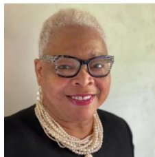
Public Defenders Office, 2 nd Judicial Circuit