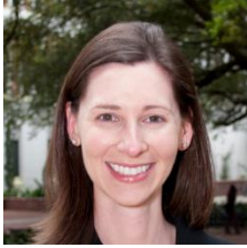
Florida State University