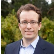
Chair At Large

The Board consists of seven volunteers, selected as listed in the captions below. At large members are chosen by the Board. To serve on the Board, you must be a registered voter in Tallahassee and preferably have some knowledge of government ethics. Board members are required to file annual financial disclosure documents with the Supervisor of Elections.